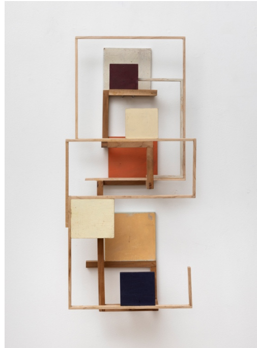
#71, 2024, wood, paint, 18 1/2 x 8 1/2 x 3 3/4"