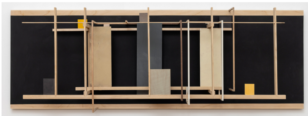
#89, 2024, wood, paint, 20 ½ x 61 x 9 ½"